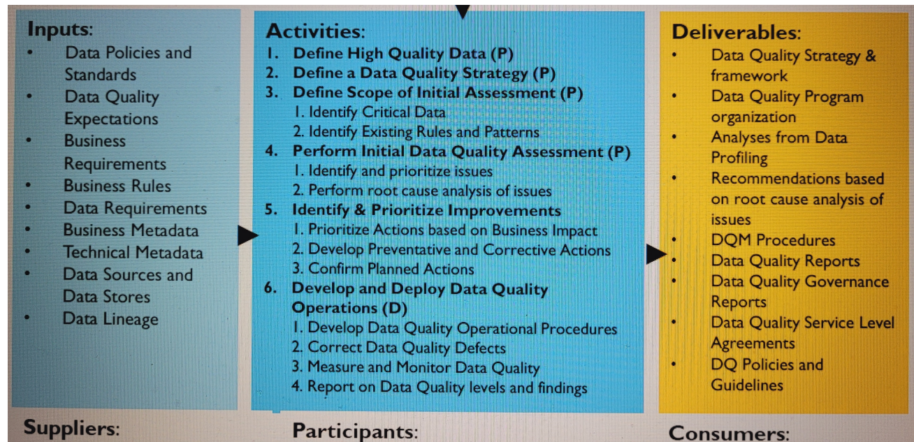
Picture 1: DAMA DMBOK v2 – (part of the) Data quality context diagram

The data quality management process consists of input (delivered by data suppliers), data quality activities and output (Deliverables used by data consumers). In this factsheet, I will focus on the (in different sources) most frequently mentioned data quality team roles and their responsibilities to fulfill needed data quality activities (see picture 1).